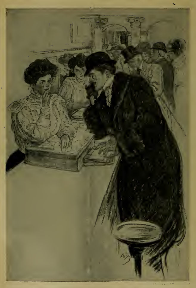
"Wooed her across the counter with a king cophetua air."